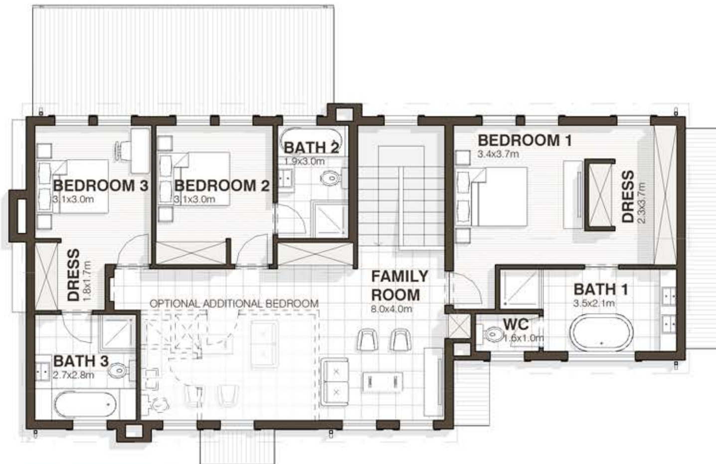
FIRST STOREY PLAN SCALE 1 : 100